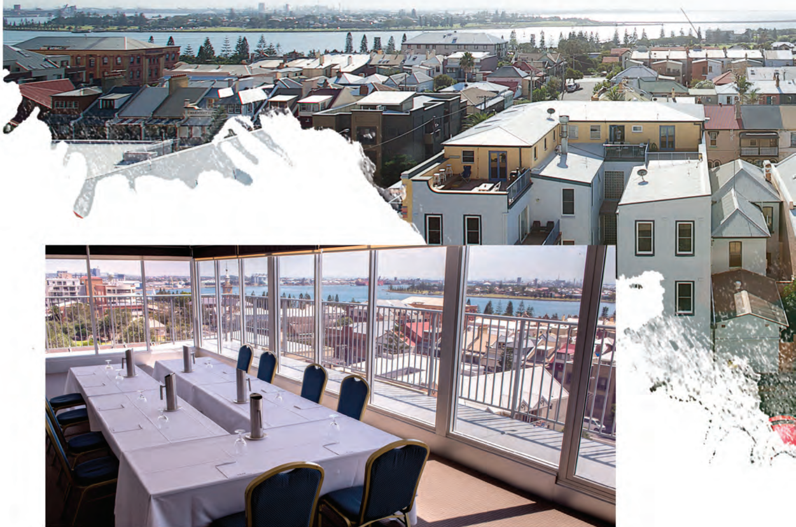
The inspirational view from Harbour View room