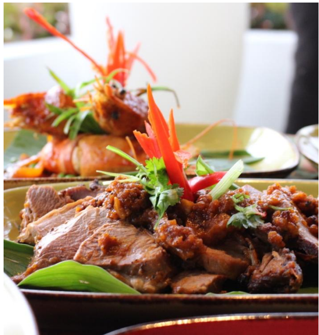
Whole Roasted Lamb Percik