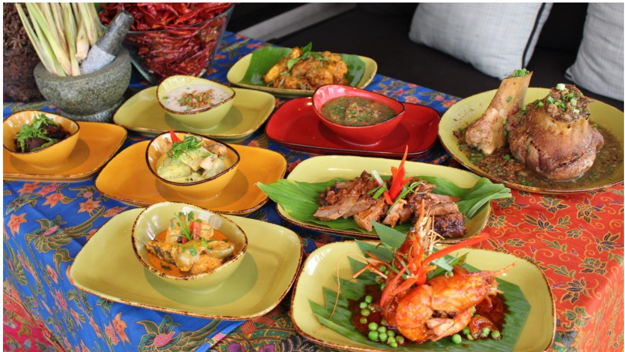
Traditional Kampung Dishes