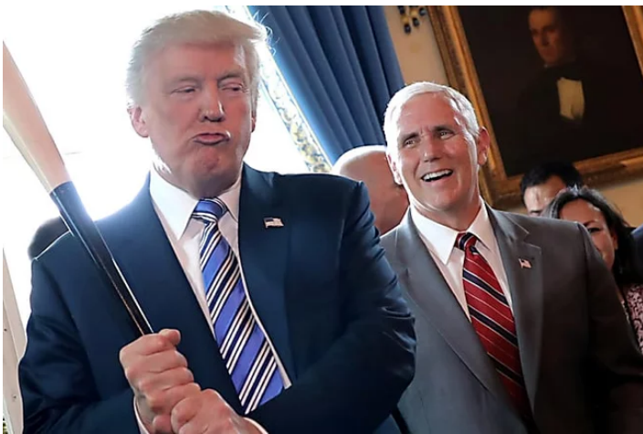
The White House is stonewalling Congress left and right on everything from the environment to the Census