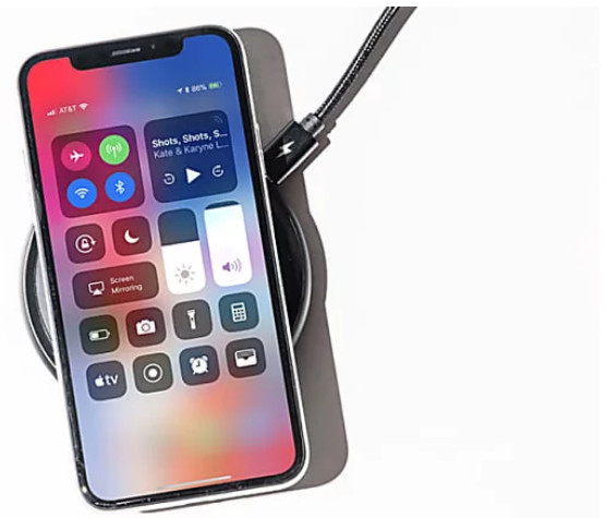
Apple is quietly rolling out a feature in its next big software update meant to prevent your iPhone's battery life from declining as quickly over time