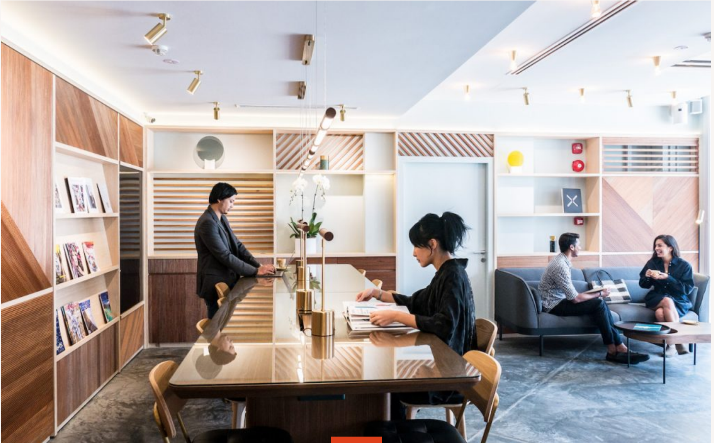
Shared spaces in KēSa house allows for interaction between guests

Made up of 10 renovated shophouses along Keong Saik Road in Chinatown, KēSa House is a flexible-living concept that offers 60 rooms and a series of enticing dining establishments. Designed by Florian Sander of iThink Consulting Group, a boutique hospitality consulting firm, this modern “accommodation solution” is a mix of old and new – as part of the renovation, its traditional shophouse façade was refreshed with a coat of aquamarine paint for a modern, vibrant look.