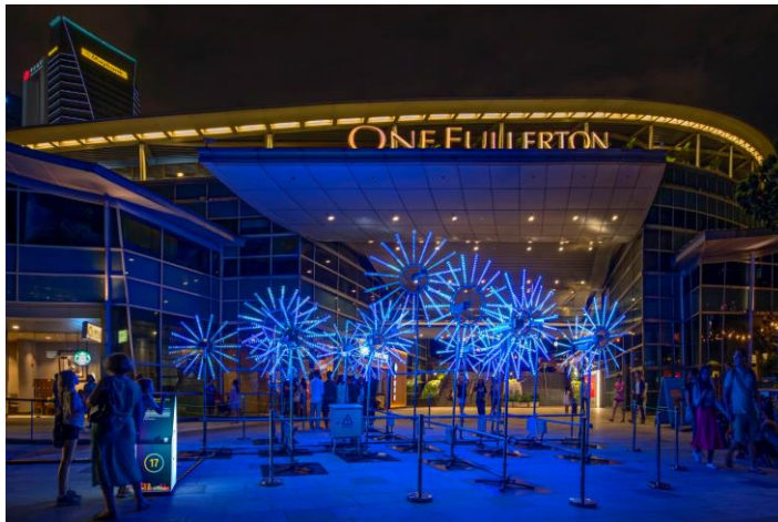
i Light Singapore

taking a walk to see nearby attractions such as the Sydney Opera House, The Royal Botanic Garden and Darling Harbour adorned in bright lights.