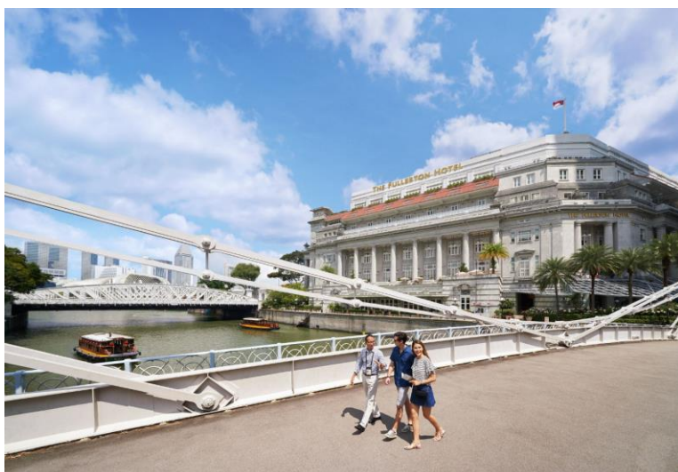
Complimentary heritage tours at The Fullerton Hotels Singapore