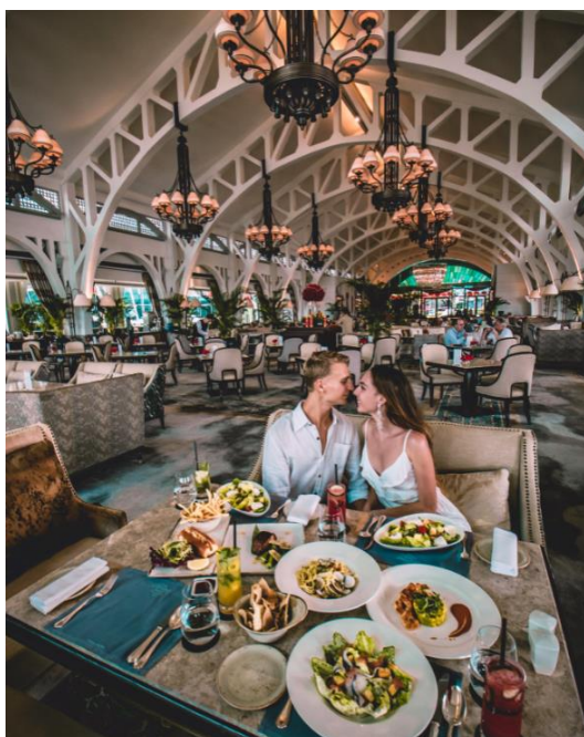
Dining at The Clifford Pier