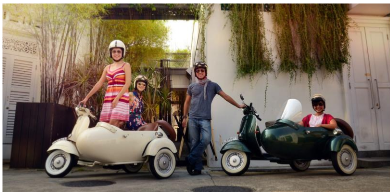
Singapore Sidecar Tours

See Singapore from a different perspective as you explore the city on a sidecar tour in a hand-restored vintage Vespa - one of the bespoke Fullerton Experiences that The Fullerton Hotels and Resorts' hotel guests can enjoy.