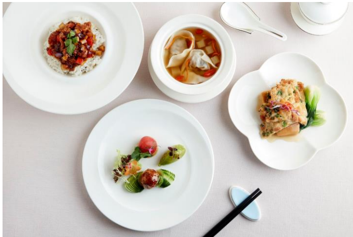
Classic Chinese dishes re-imagined in Jade restaurant's plant-based menu

Savour a taste of sustainable living with "Taste the Future", a new five-course plant-based menu at The Fullerton Hotel Singapore's Jade restaurant which features re-imagined versions of classic Chinese dishes – all without meat, eggs or dairy.