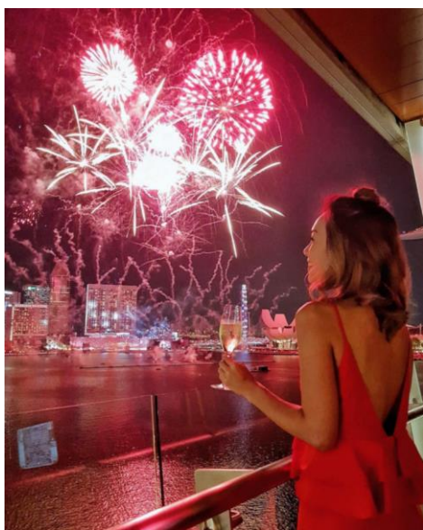
View of the fireworks at The Fullerton Heritage precinct