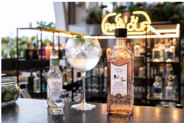
Enjoy a wide collection of gins at the Gin Parlour