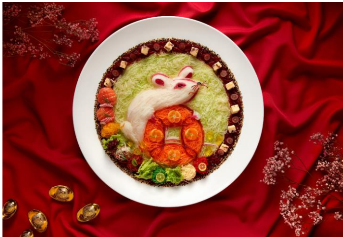
Welcome the Year of the Rat by tossing a Gold Rush Yu Sheng for good fortune at Jade restaurant

If you are Down Under, join the inaugural Lunar New Year celebrations at The Fullerton Hotel Sydney with a traditional 'Mei Hua Zhuang' lion dance performance on 25 January, and revel in the festive atmosphere with themed cocktails at The Bar. Chinatown's celebrations are located just 15 minutes from the hotel on foot, or via the new light rail network.