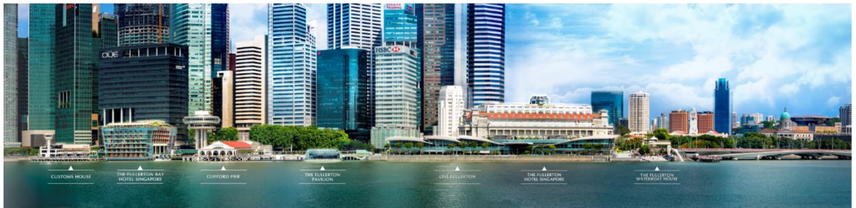
The Fullerton Heritage precinct

Historically significant buildings abound in The Fullerton Heritage precinct, a world-class waterfront development located in the heart of Singapore's city centre. These include The Fullerton Hotel Singapore, a former General Post Office which is now a 400-room hotel and National Monument; The Clifford Pier, an eponymous dining destination in The Fullerton Bay Hotel Singapore which occupies the space of the historic landing point of Singapore's forefathers and immigrants; as well as historic landmarks including The Fullerton Waterboat House and Customs House; and other contemporary and stylish buildings which offer sophisticated dining experiences.