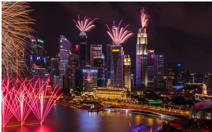
View of the fireworks at The Fullerton Heritage precinct

The Lion City is renowned for its scintillating fireworks displays, and during celebrations such as New Year's Eve, Chinese New Year, National Day and the Formula 1 Grand Prix, there's no better vantage point than your guest room balcony at The Fullerton Hotels Singapore.