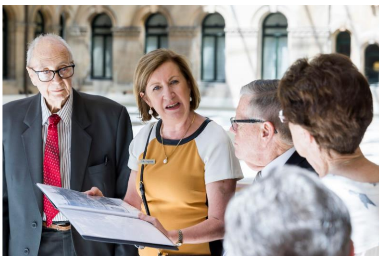
Complimentary heritage tours at The Fullerton Hotel Sydney