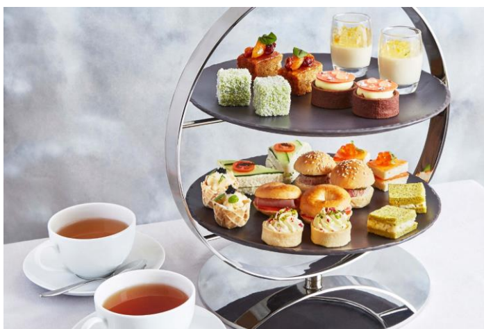
Afternoon Tea at The Bar

Enjoy a traditional afternoon tea with all the trimmings including freshly baked scones and sweet and savoury options such as Lobster Cornet a l'Oriental, duck rillettes in sesame bun and smoked salmon mille-feuille with caviar, chocolate moelleux, pecan maple tart or a pandan lamington. Choose your tippie of choice from an extensive TWG tea menu or enjoy a champagne or a signature Sydney Sling cocktail, in the grand historic surrounds of The Bar at The Fullerton Hotel Sydney.