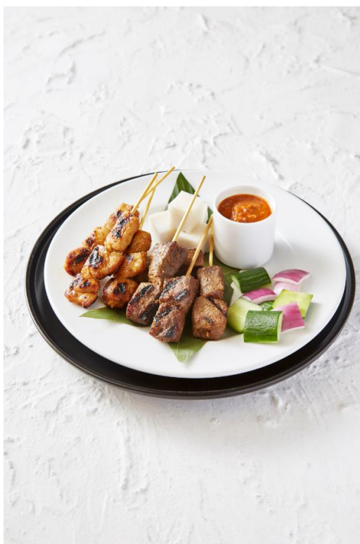
Learn to make iconic Singaporean dishes in a custom cooking class

Learn how to recreate iconic Singaporean dishes including Satay, Popiah and Hainanese Chicken Rice – in a dedicated heritage cooking class led by a Fullerton chef.