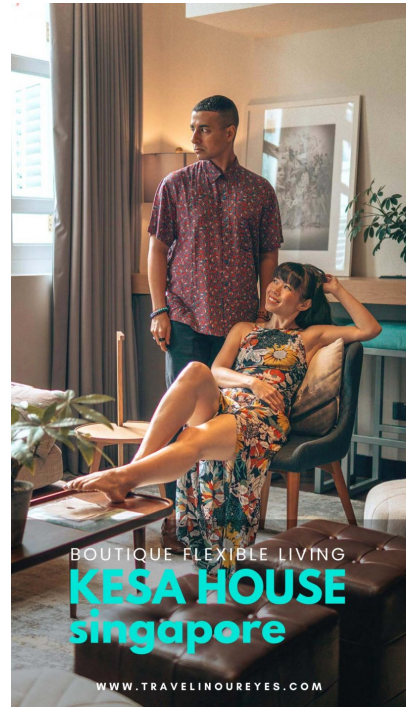
( https://www.travelinoureyes.com/kesa-house-singapore/5-4/ )

( /#pinterest ) ( /#facebook ) ( /#email ) ( /#whatsapp ) ( /#twitter ) ( /#reddit )