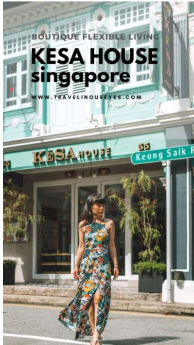
( https://www.travelinoureyes.com/kesa-house-singapore/6-3/ )