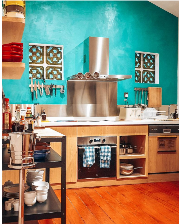
Kesa House is also great for people who like to have access to full kitchen facilities while they travel!