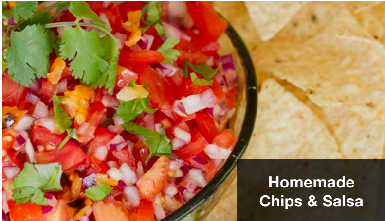
Homemade Chips & Salsa