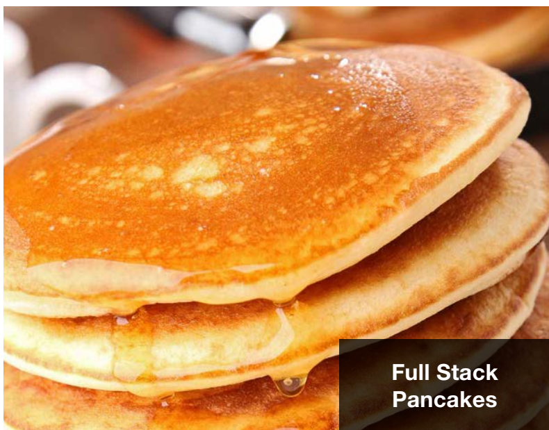
Full Stack Pancakes

2 eggs any style served with hash browns, 2 sausage links or bacon strips and choice of toast.