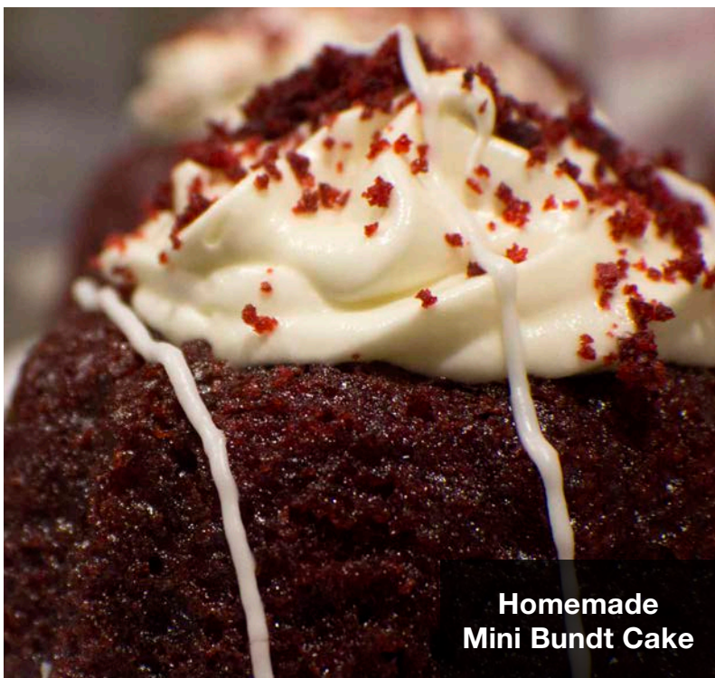
Homemade Mini Bundt Cake