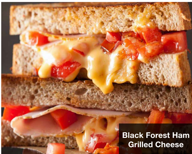
Black Forest Ham Grilled Cheese