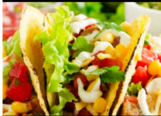
FIESTA TACO SUNDAYS