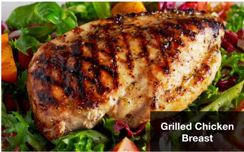
Grilled Chicken Breast