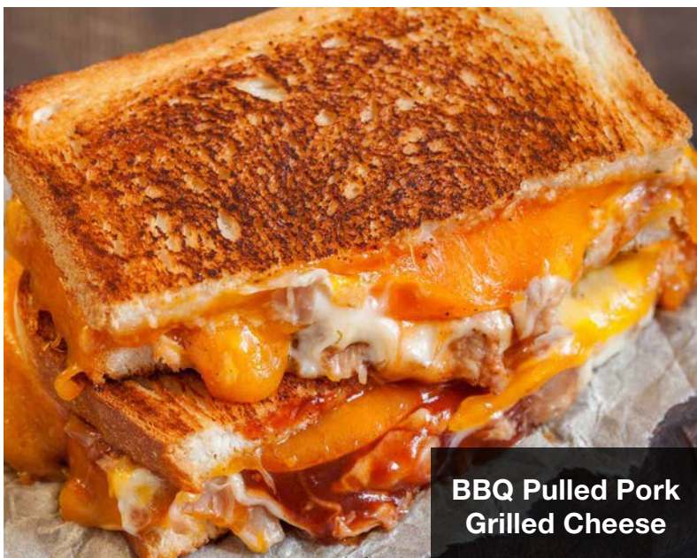
BBQ Pulled Pork Grilled Cheese