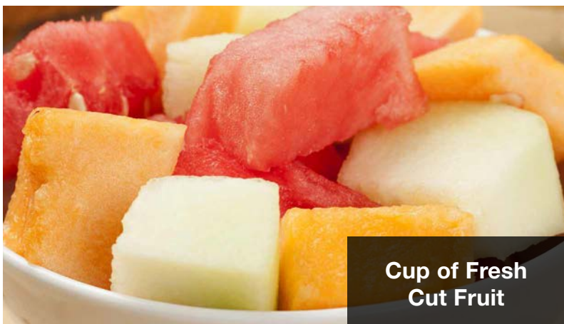
Cup of Fresh Cut Fruit