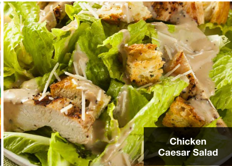
Chicken Caesar Salad