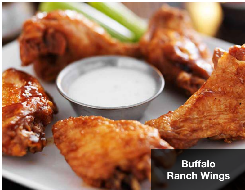
Buffalo Ranch Wings