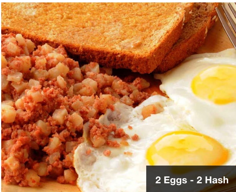
2 Eggs - 2 Hash