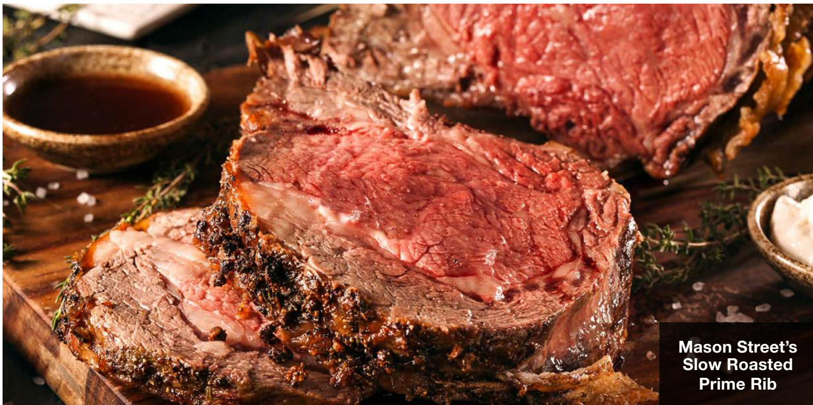
Mason Street's Slow Roasted Prime Rib

Flour tortilla stuffed with beef, beans, cheeses, rice, lettuce and tomatoes, rolled up and topped off with sour cream and salsa.