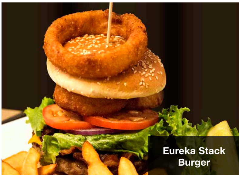
Eureka Stack Burger

Three Cheese Grilled Cheese .....$4.99 Sharp cheddar, Swiss and pepper jack cheese.