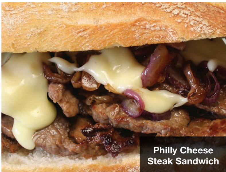
Philly Cheese Steak Sandwich