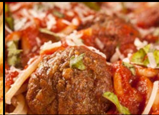
LITTLE ITALY THURSDAYS