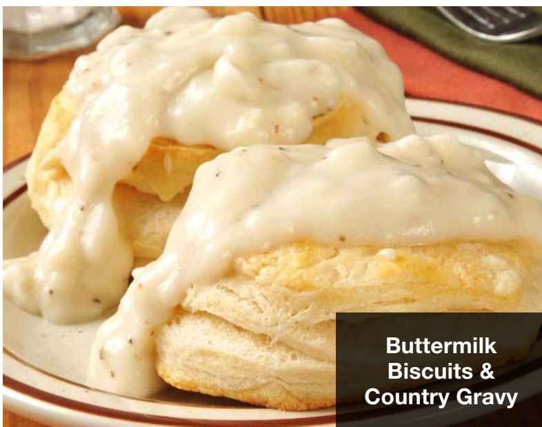
Buttermilk Biscuits & Country Gravy