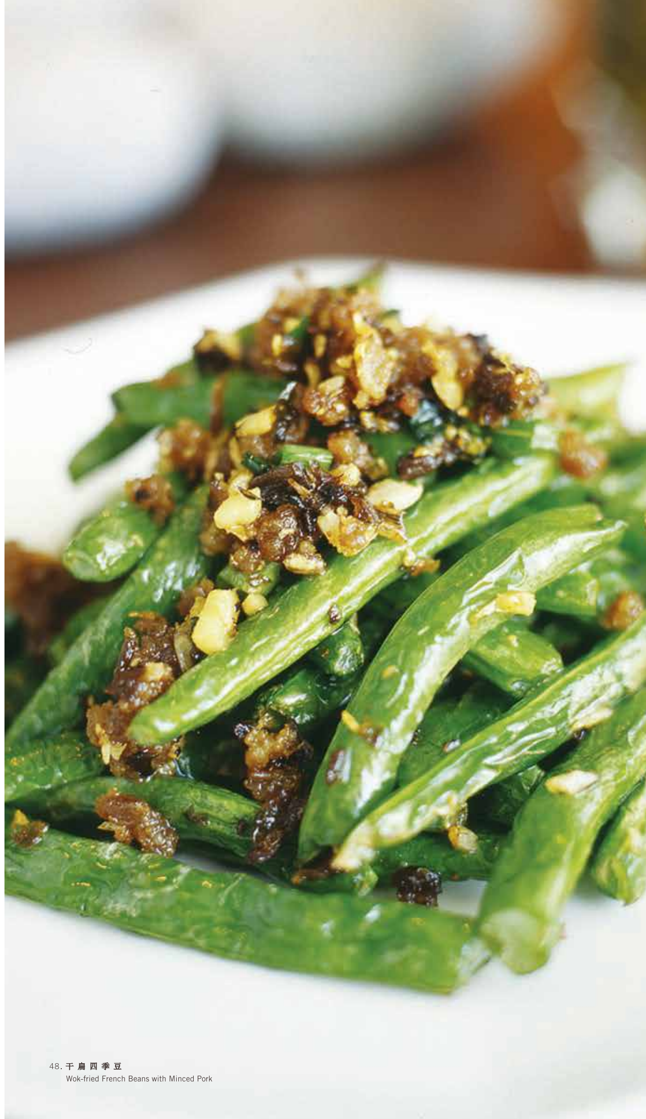
48. 干扁四季豆 Wok-fried French Beans with Minced Pork