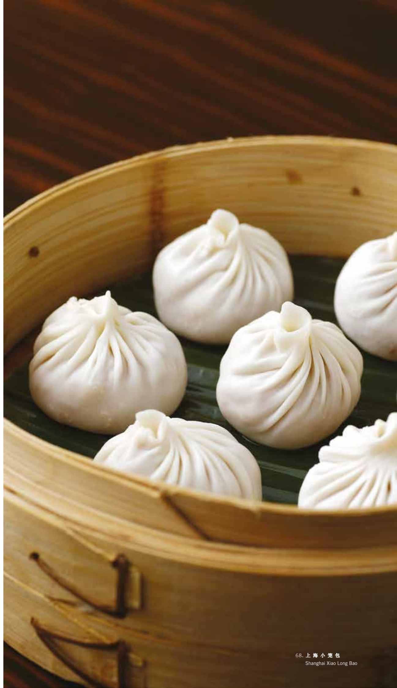
68. 上海小笼包 Shanghai Xiao Long Bao