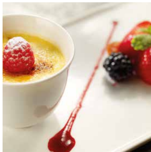
78. 菠萝蜜奶油草莓蜜饯 Chempedak Crème Brûlée with Berries