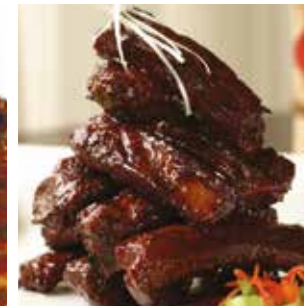
40. 蜜汁排骨 Honey Glazed Pork Rib