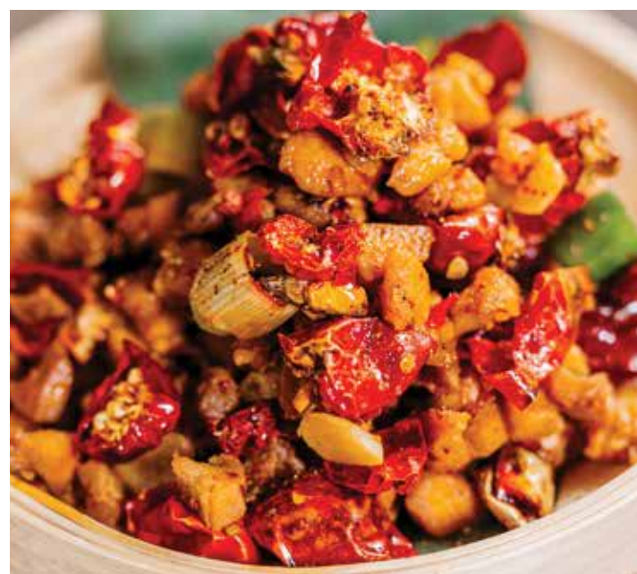
33. 川式辣子鸡 Traditional Sichuan Spicy Diced Chicken