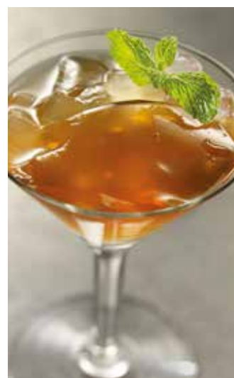
80. 芦荟柠檬香草果冻 Chilled Lemongrass Jelly with Aloe Vera