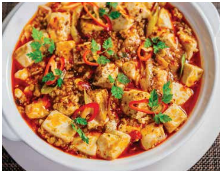
55. 麻婆豆腐 Traditional Ma Po Tofu