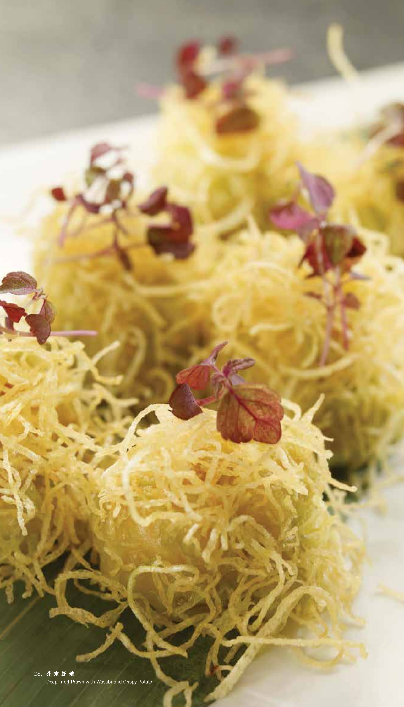
28. 芥末虾球 Deep-fried Prawn with Wasabi and Crispy Potato