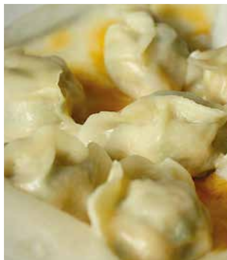
71. 四川钟水饺 Sichuan Minced Meat Dumpling with Chilli Oil