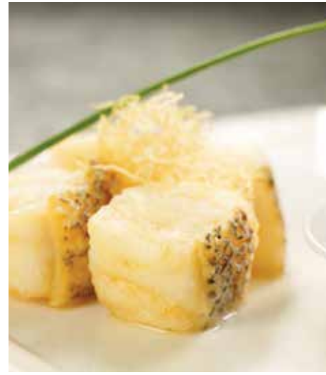
1. 醋拌鳕鱼 Crispy Cod Fish with Aged Vinegar