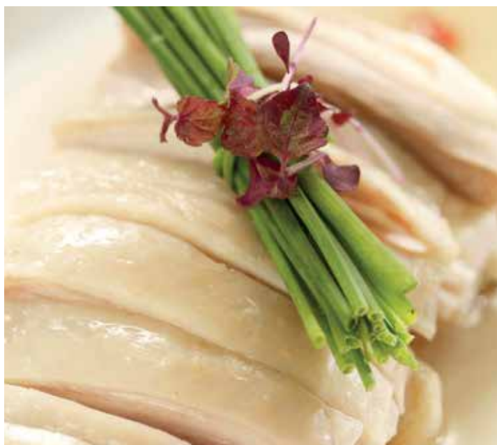
6. 醉土鸡 Aged Drunken Chicken