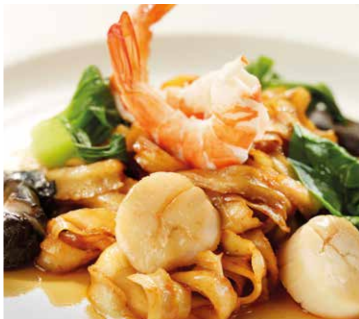
57. 海鲜炒刀削面 Fried Shaved Noodle with Seafood