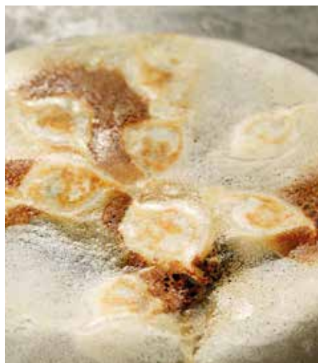
67. 沈阳冰花煎饺 Shenyang Pan-fried Snow Flake Dumpling