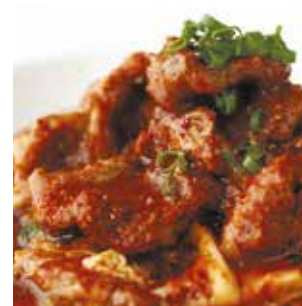
37. 水煮牛肉 Sliced Beef with Spicy Sichuan Pepper Sauce