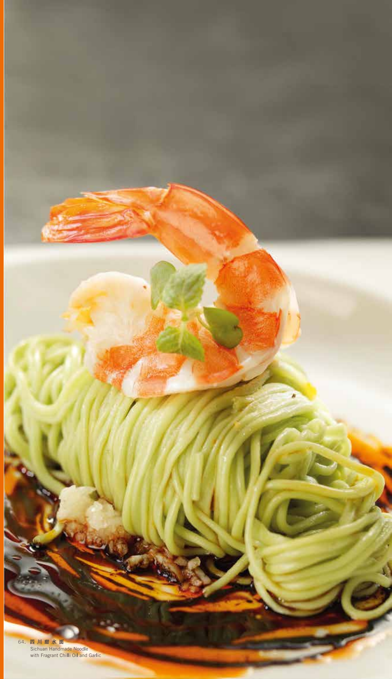
64. 四川甜水面 Sichuan Handmade Noodle with Fragrant Chilli Oil and Garlic