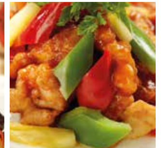
43. 糖醋里脊 Sweet and Sour Pork