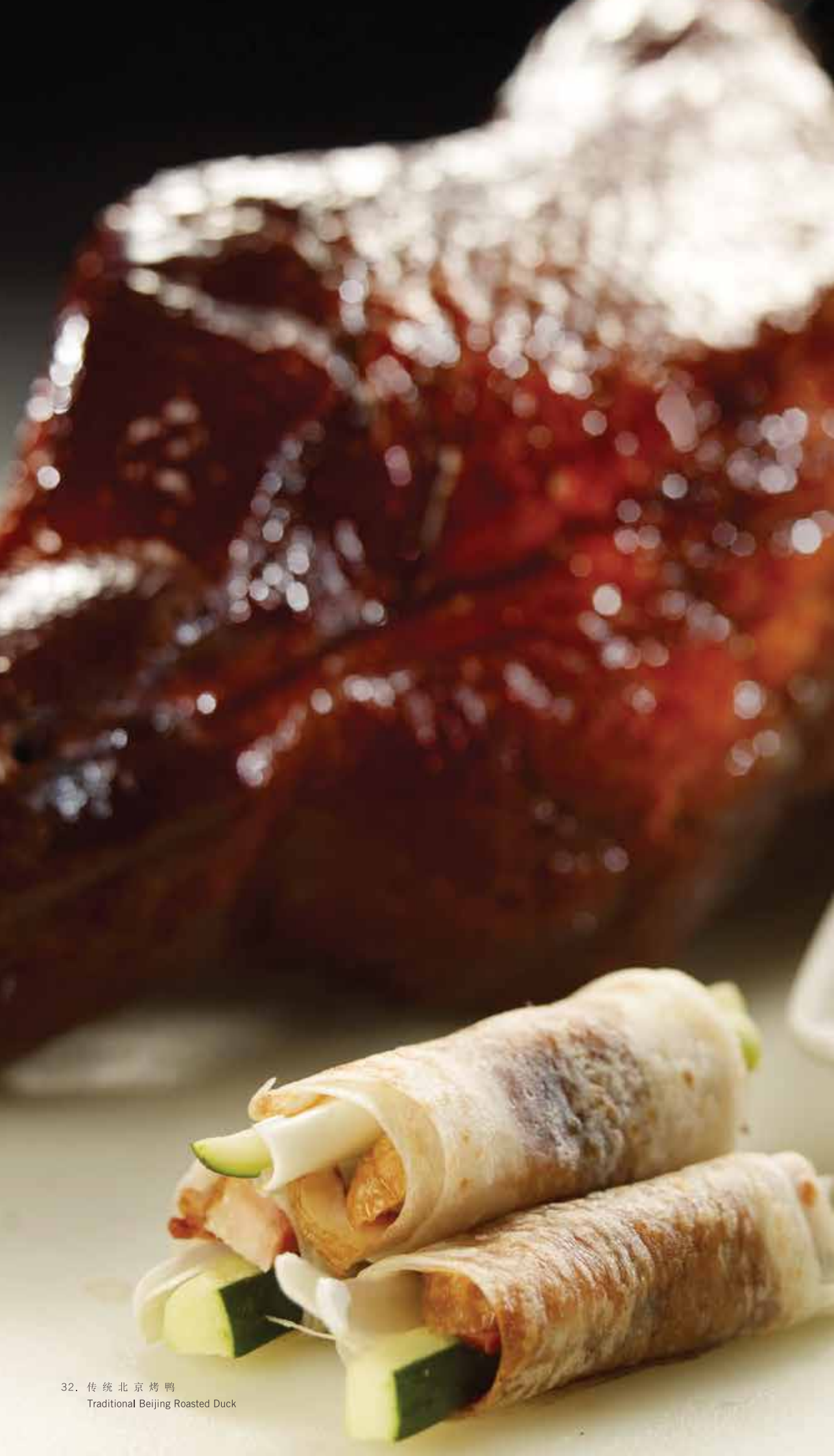
32. 传统北京烤鸭 Traditional Beijing Roasted Duck