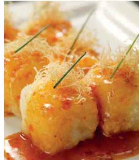
19. 鱼香香煎银鳕鱼 Pan-fried Cod Fish with Sichuan Spicy Sauce