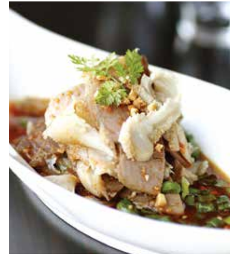
4. 夫妻肺片 Sliced Beef & Tripe with Spicy Sauce