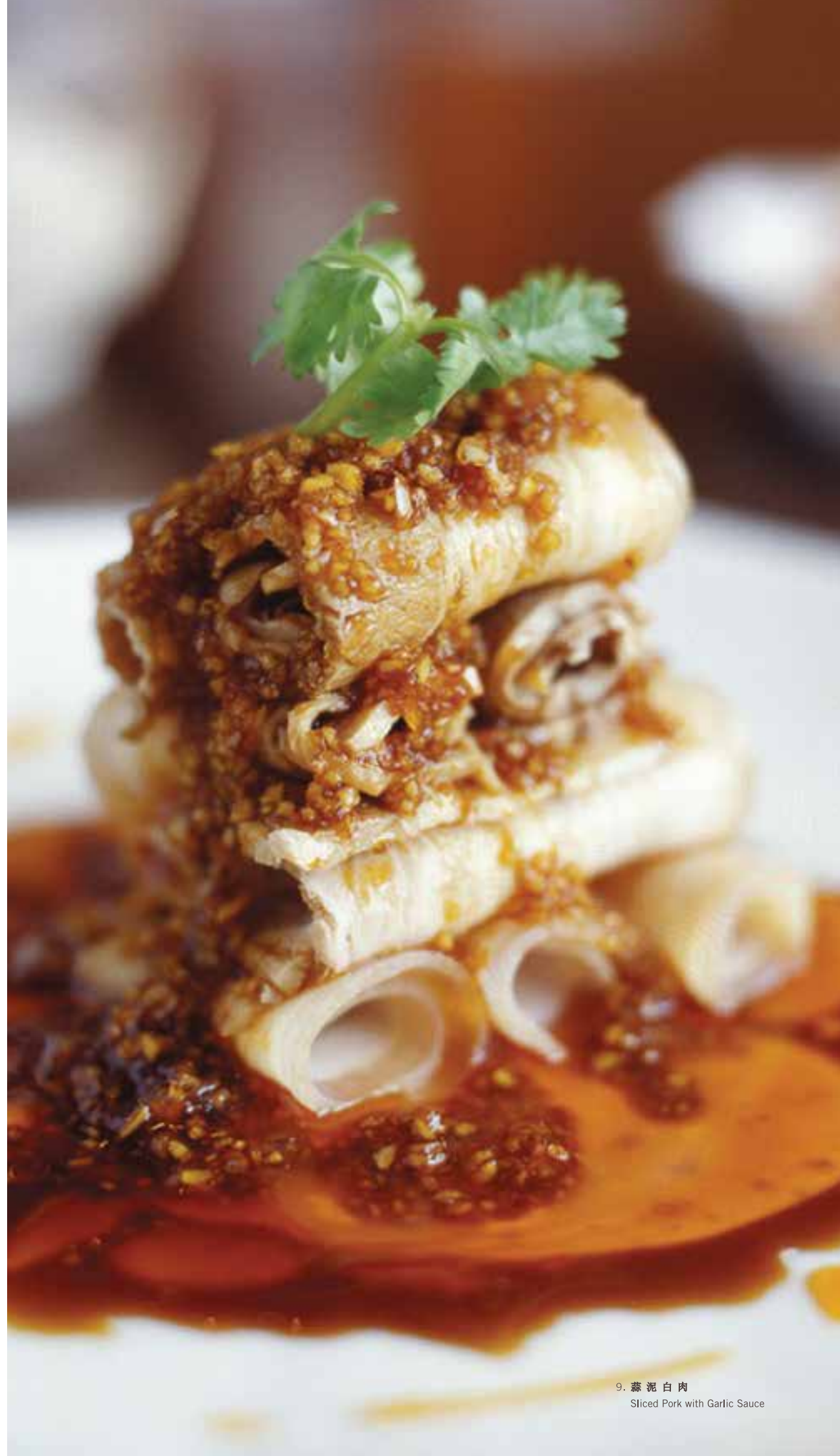
9. 蒜泥白肉 Sliced Pork with Garlic Sauce