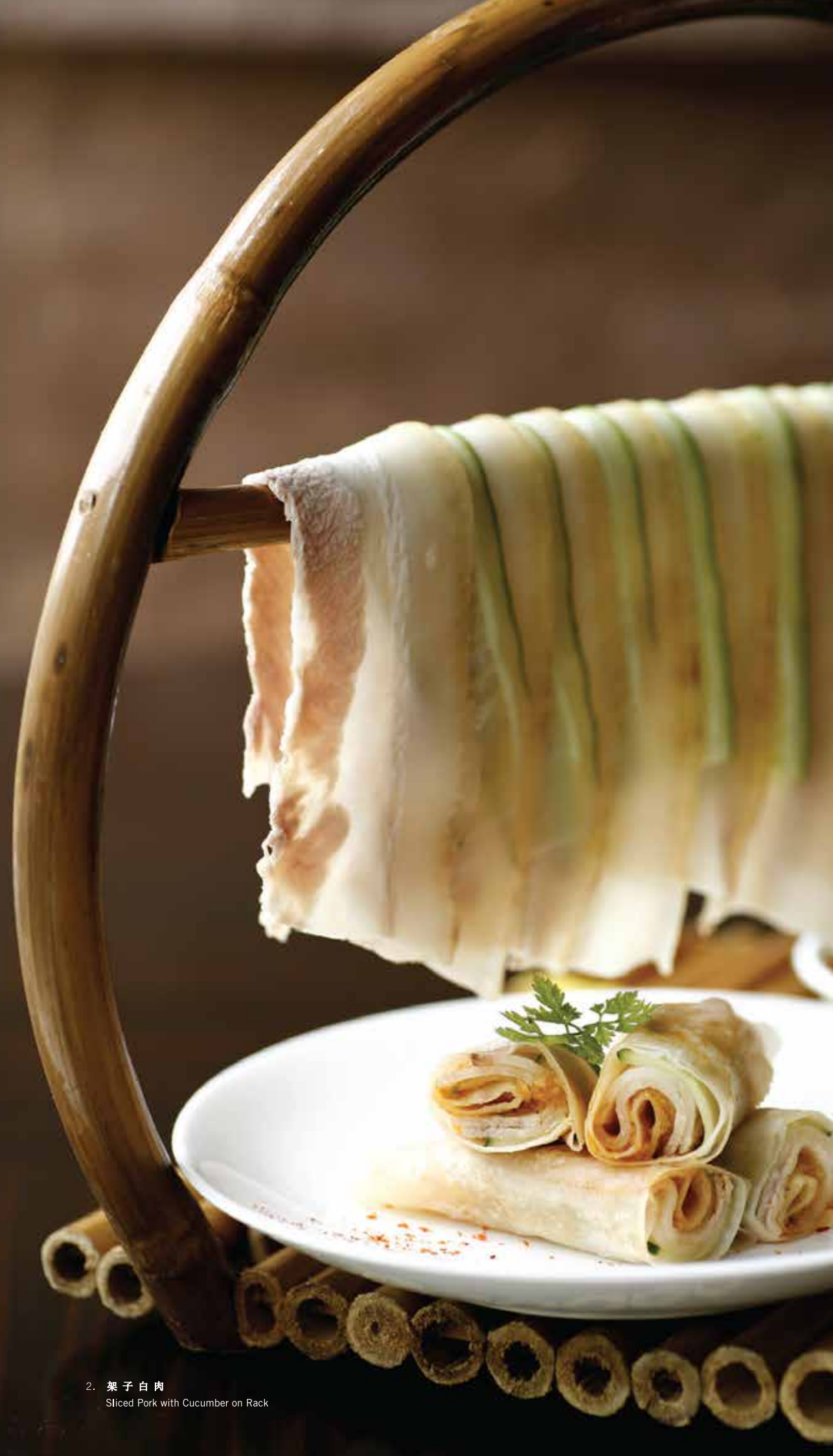
2. 架子白肉 Sliced Pork with Cucumber on Rack