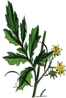
FIG. 3 — Mint leaves Mentha