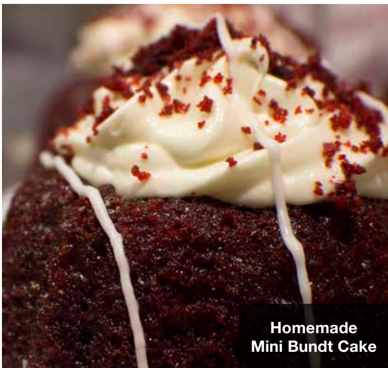
Homemade Mini Bundt Cake