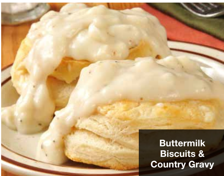
Buttermilk Biscuits & Country Gravy