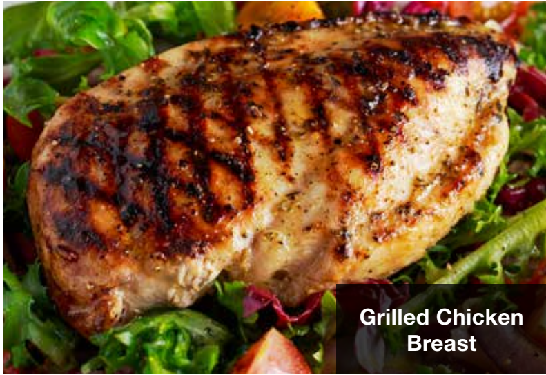
Grilled Chicken Breast