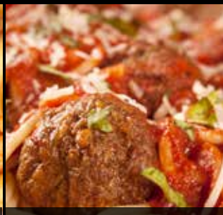
LITTLE ITALY THURSDAYS