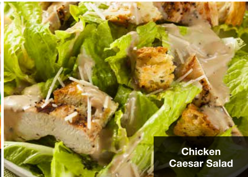
Chicken Caesar Salad