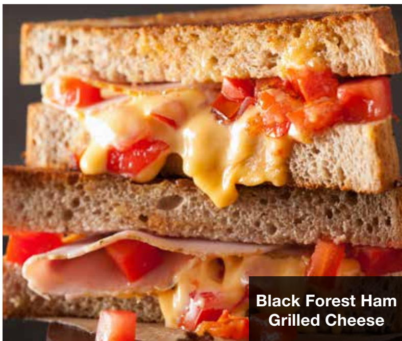
Black Forest Ham Grilled Cheese