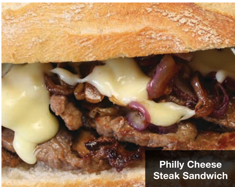
Philly Cheese Steak Sandwich