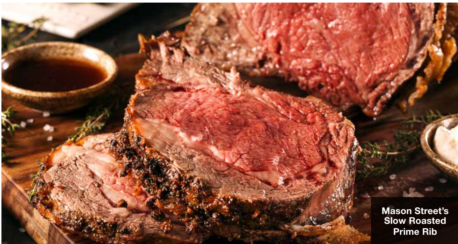
Mason Street's Slow Roasted Prime Rib

Grilled chicken tossed in a homemade alfredo sauce served over fettuccine with garlic toast and choice of soup or salad.