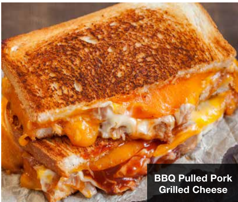
BBQ Pulled Pork Grilled Cheese