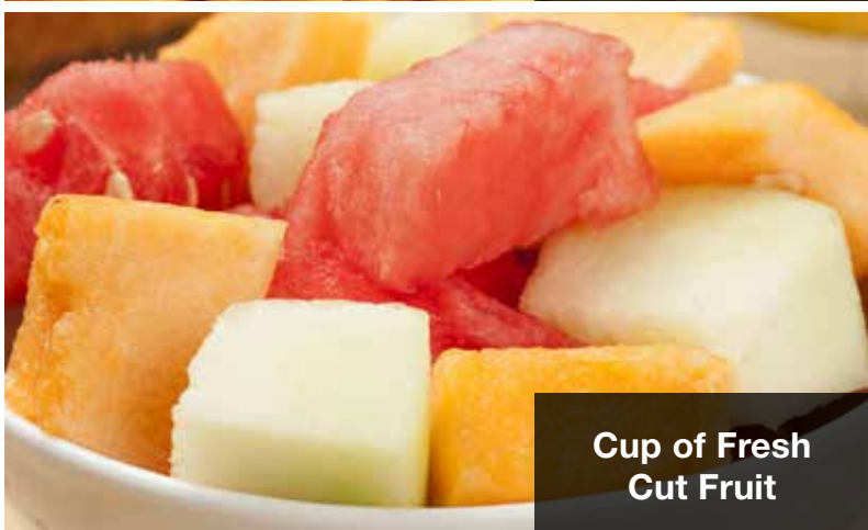
Cup of Fresh Cut Fruit