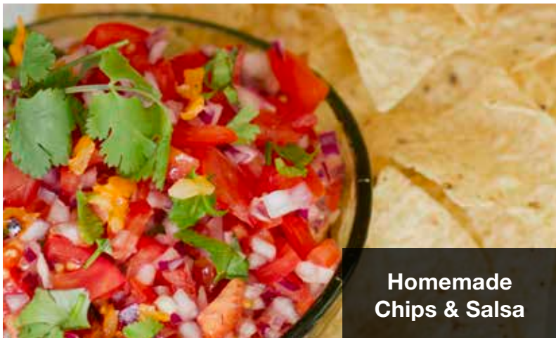
Homemade Chips & Salsa