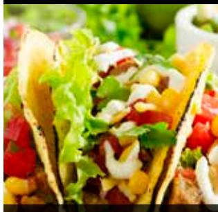
FIESTA TACO SUNDAYS