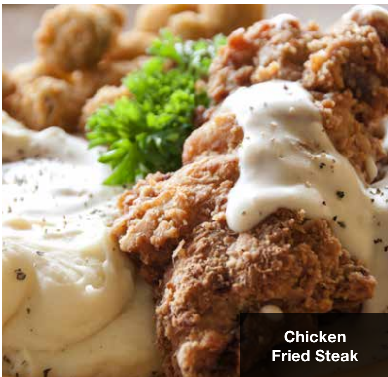
Chicken Fried Steak