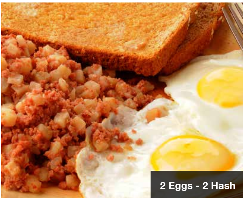
2 Eggs - 2 Hash