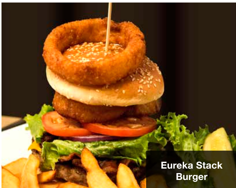
Eureka Stack Burger

Sharp cheddar cheese over pulled pork and our signature BBQ sauce.